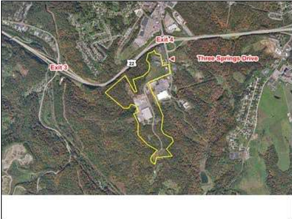
Three Springs Business Park.jpg