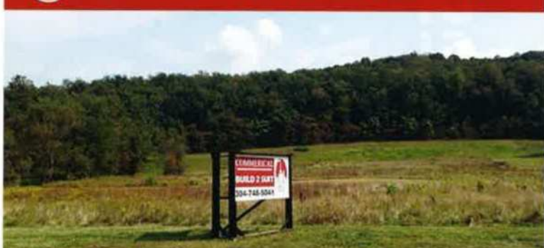
3 Hancock County Business Park - Newell

9 acres; 25,000 sq. ft. Rail access and access to WV Route 2 - See Page 12