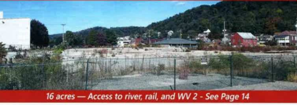
7 Follansbee Steel - Follansbee

16 acres — Access to river, rail, and WV 2 - See Page 14