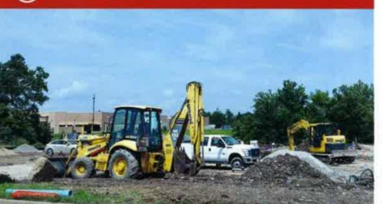
6 Three Springs Business Park - Weirton

56 acres Access to US 22 and Three Springs Drive - See Page 14