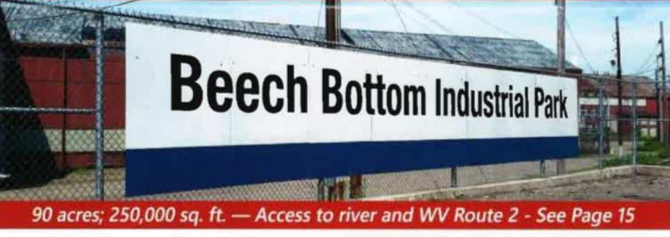
9 Beech Bottom Industrial Park - Beech Bottom

90 acres; 250,000 sq. ft. — Access to river and WV Route 2 - See Page 15