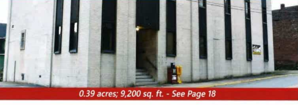
13 The Weirton Daily Times Building - Weirton

2 acres; 18,000 sq. ft. — proximate to WV Route 2 - See Page 18