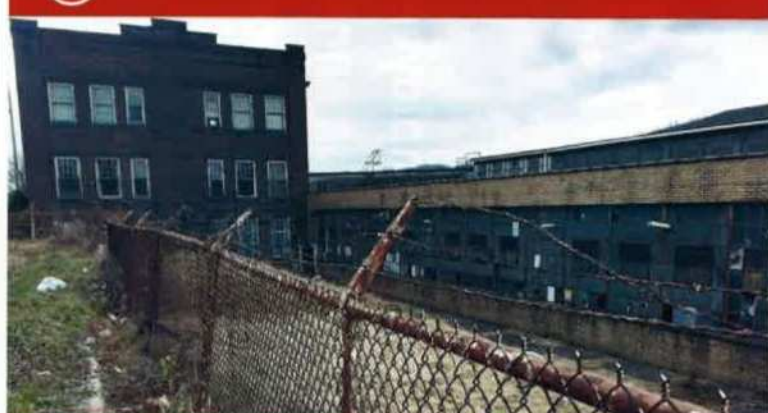
2 Newell Porcelain - Newell

9 acres; 25,000 sq. ft. Rail access and access to WV Route 2 - See Page 12