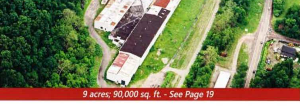
15 Colliers Steel - Colliers

8.5 acres; 70,000 sq. ft. — access to river and to WV Route 2 - See Page 19