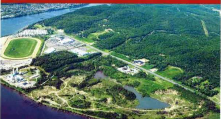
4 Mountaineer Surplus Property - Newell

260 acres River, rail, and WV Route 2 - See Page 13