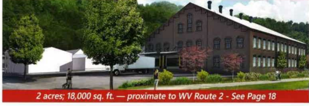
12 Brooke Glass - Wellsburg

2 acres; 18,000 sq. ft. — proximate to WV Route 2 - See Page 18