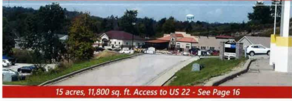
10 The Village at Colliers Way - Weirton

15 acres, 11,800 sq. ft. Access to US 22 - See Page 16