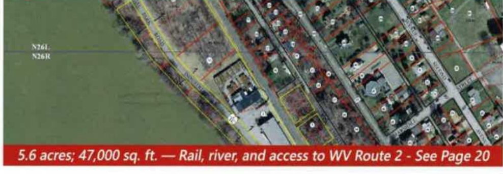
16 New Cumberland Industrial Park - New Cumberland

5.6 acres; 47,000 sq. ft. — Rail, river, and access to WV Route 2 - See Page 20