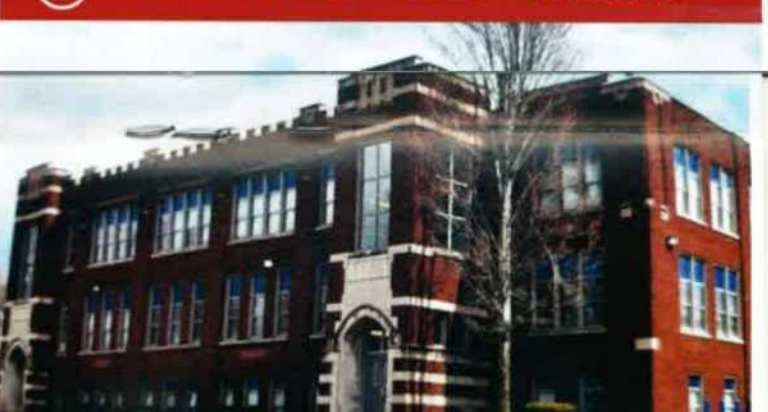
5 Follansbee Middle School - Follansbee

5.6 acres; 90,000 sq. ft. Access to WV Route 2 - See Page 13