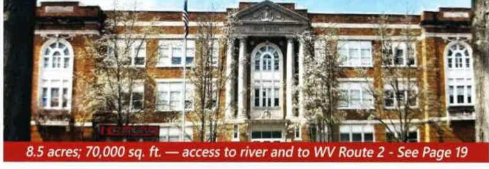
14 Wellsburg Middle School - Wellsburg

8.5 acres; 70,000 sq. ft. — access to river and to WV Route 2 - See Page 19