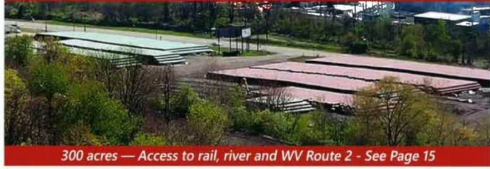
8 Trimodal Terminal - Follansbee

300 acres — Access to rail, river and WV Route 2 - See Page 15